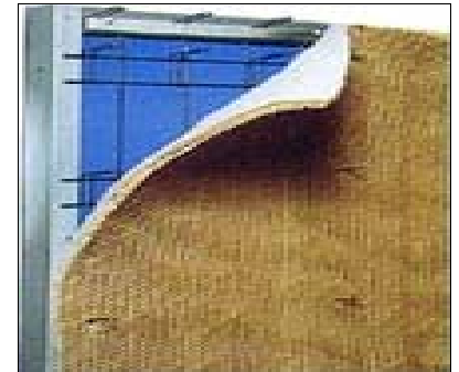
Paper-Poly Paint Arresting Filter Media

5 Layer Paper is enhanced with polyester backing to provide maximum paint holding capacity and efficiency. The Kraft Paper-Poly media is highly effective in operations where high-solids, bake enamels, water-borne or tacky coatings are being sprayed. Slower air velocity aids in transfer efficiency of overspray particulates. In appropriate process conditions, this media's efficiency rating consistently reaches 99% , keeping finishing operations EPA compliant.